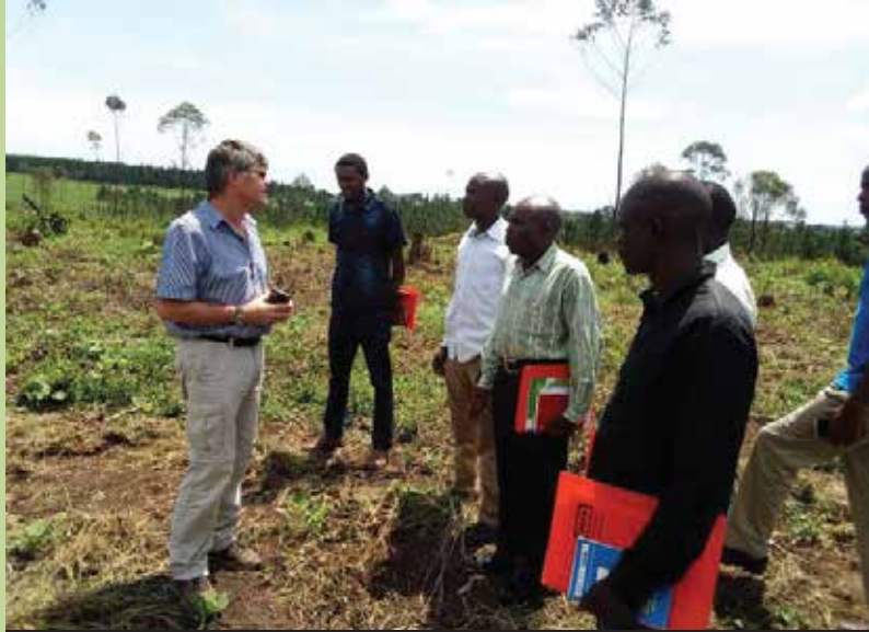
Preparations for the main assessment in Mubende Dec 2018

The individual plantation owner can certify his plantation under the FSC certification body or can participate within a group scheme under a joint certificate. This is typical for groups of tree growers like UTGA. The group certification process allows for the extension of scope by adding new Forest Management Units that meet the certification requirements from time to time.